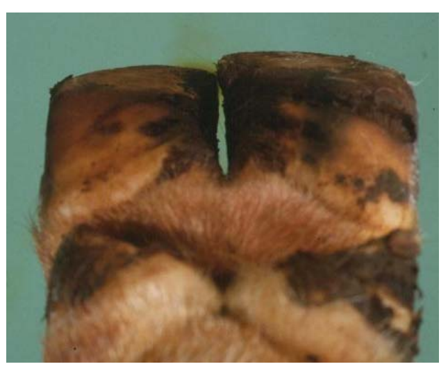
Figure: Claw overgrowth will often be the only problem to correct in the early stages of lameness

Trends can also be displayed on graphs (below) to identify the most likely causes and measure the impact of management changes. Percentages of score 2 cows (likely to benefit from