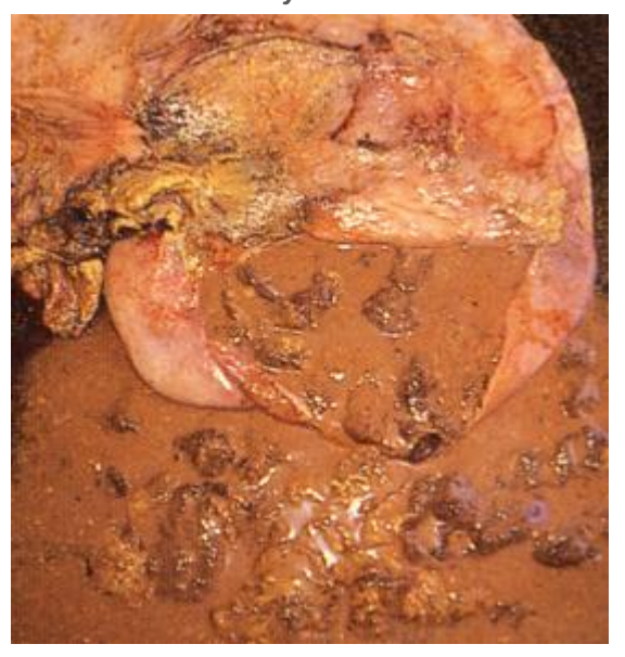
Fig 2: Septic metritis is probably the most common cause of sick cows in the first few days after calving