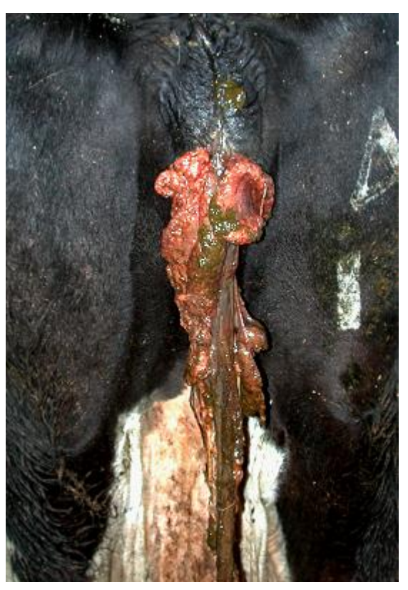
Fig 1: The main benefit of removing retained fetal membranes is the removal of the rotten tissue, there is no benefit on fertility.

The majority of the effect of retained fetal membranes depends on the severity of associated uterine infection. The severity of infection depends upon factors other than retention of the membranes, such as whether there was a difficult calving or whether the cow is in poor condition. Retained fetal membranes alone do not cause poor fertility, so leaving them attached rather than removing them does not lead to poorer fertility.